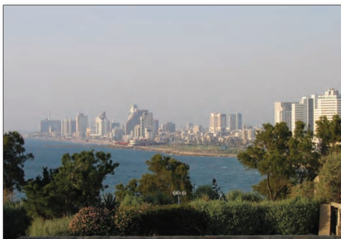
Tel Aviv, from the ancient port of Jaffa