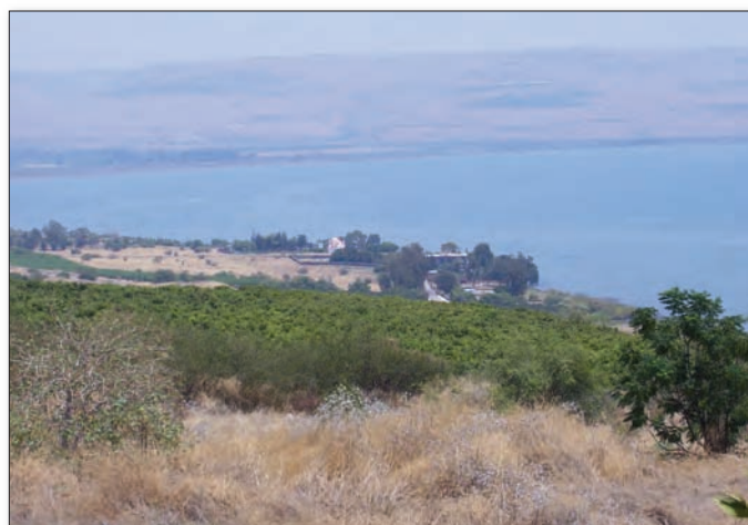
Sea of Galilee, viewed from the Mount of Beatitudes