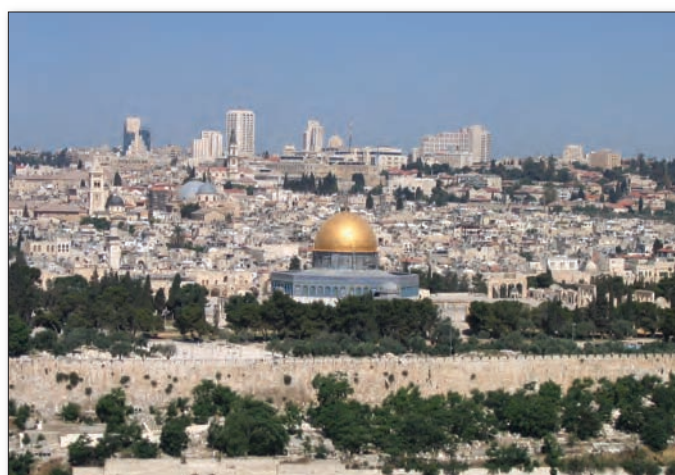
Temple Mount, viewed from the Mount of Olives